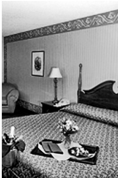
Highlander Inn has 66 spacious and beautifully decorated rooms.